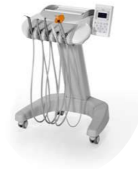
Astral Premium Model

There are various ranges of mobile units: Premium , Lux and Eco . The Premium range features an induction micromotor integrated into the control panel. The Lux range has an electric brush micromotor and the Eco range features pneumatic instrumentation.