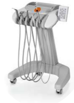
Astral Lux Model