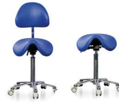
Pony Model with backrest