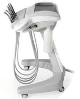
Astral Eco Model