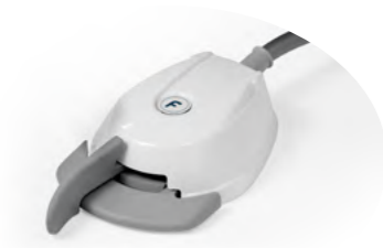
Progressive Pneumatic Model

There are two types: pneumatic pedals with instrument rpm control, water and chip blower selector, and a multifunction pedal for instrument control and to adjust the chair.